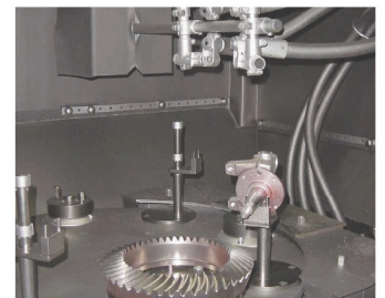
4 satellites and 4 fixed stations