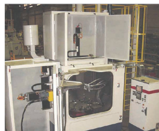
MP1200 with lateral lance peening unit