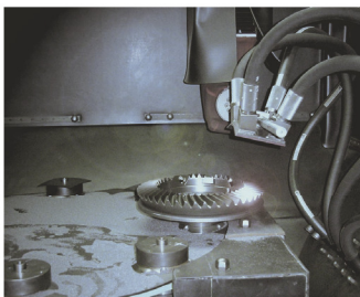
8 Satellites for heavy duty gear peening