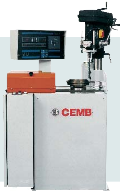
VU 15 T

complete with manual drill unit for flywheels, pulleys, etc.