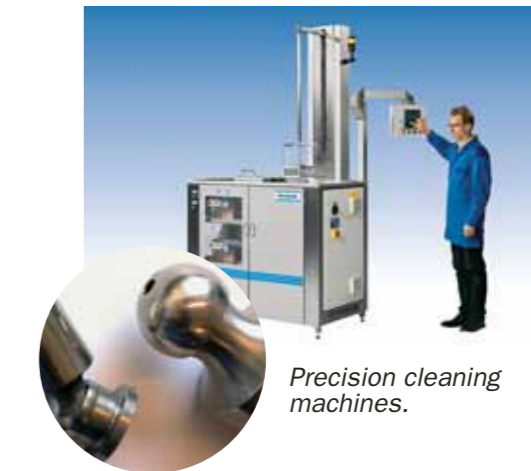
Precision cleaning machines.