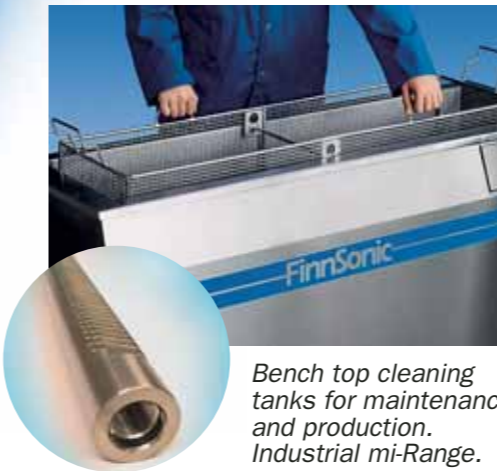
Bench top cleaning tanks for maintenance and production. Industrial mi-Range.