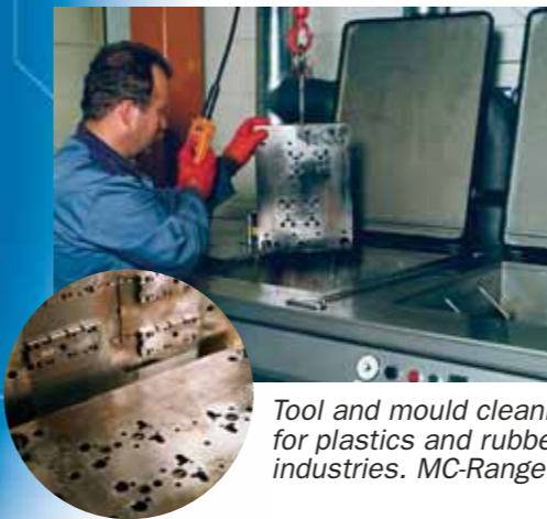
Tool and mould cleaning for plastics and rubber industries. MC-Range.