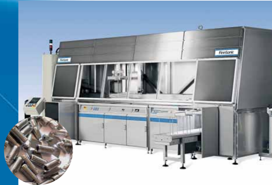
Modular multi stage systems for parts cleaning. Crystal Range.