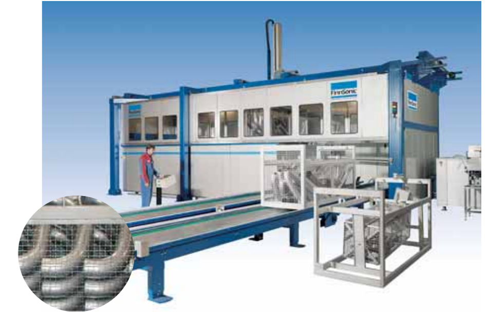
Cleaning lines for tubes e.g. in automotive industry.