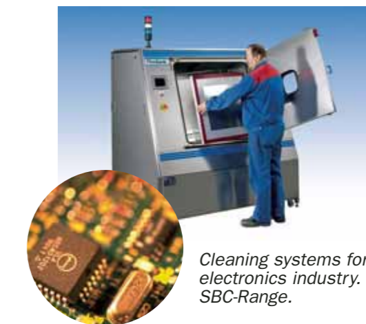
Cleaning systems for electronics industry. SBC-Range.