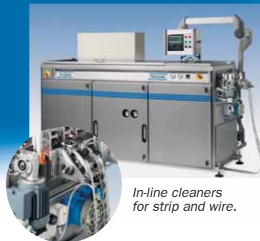
In-line cleaners for strip and wire.