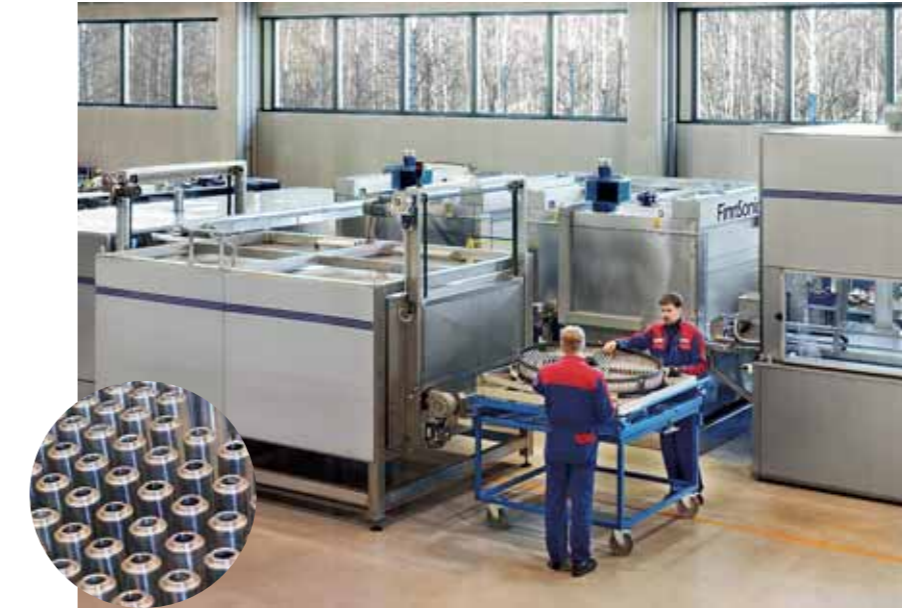
High capacity production cleaning plants.