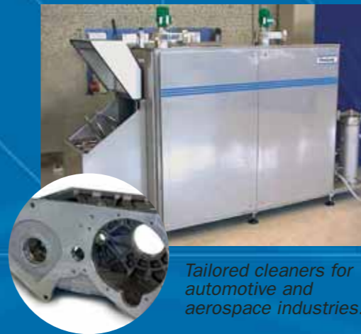
Tailored cleaners for automotive and aerospace industries.