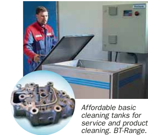
Affordable basic cleaning tanks for service and production cleaning. BT-Range.